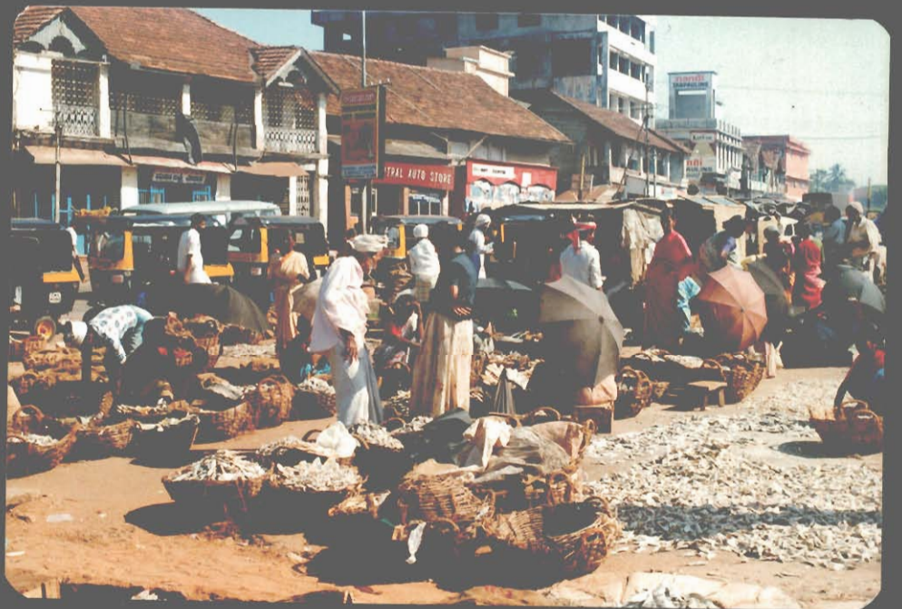
(8) DRY FISH MARKET