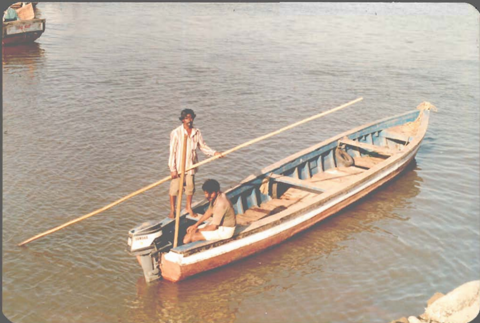
(5) OUT-BOARD ENGINE BOAT