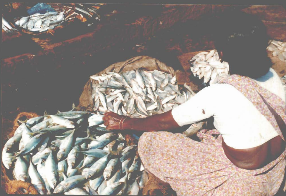
(10) MACKEREL AND SARDINE