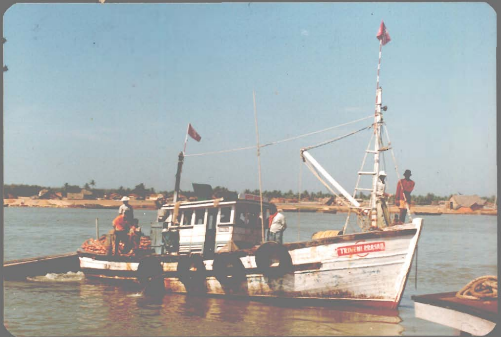
(3) A TRAWLER