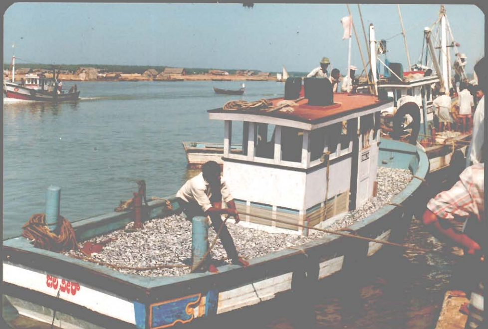
(4) TRAWLER WITH CATCHES