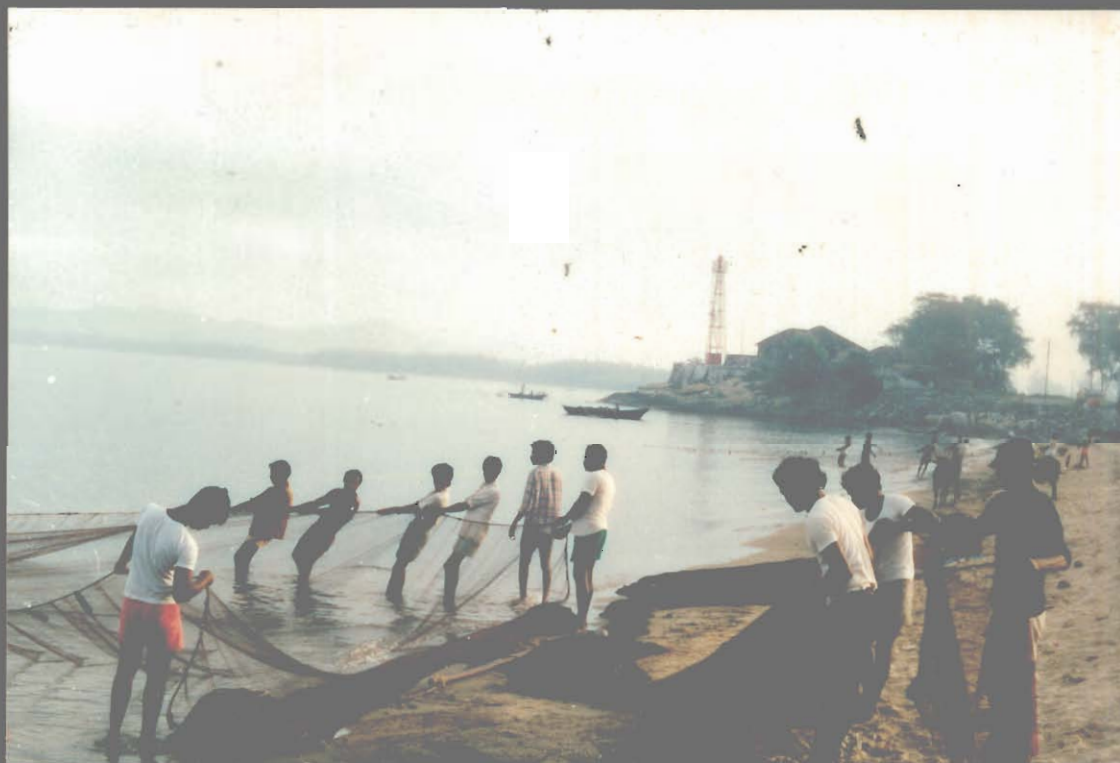
(1) RAMPANI UNIT