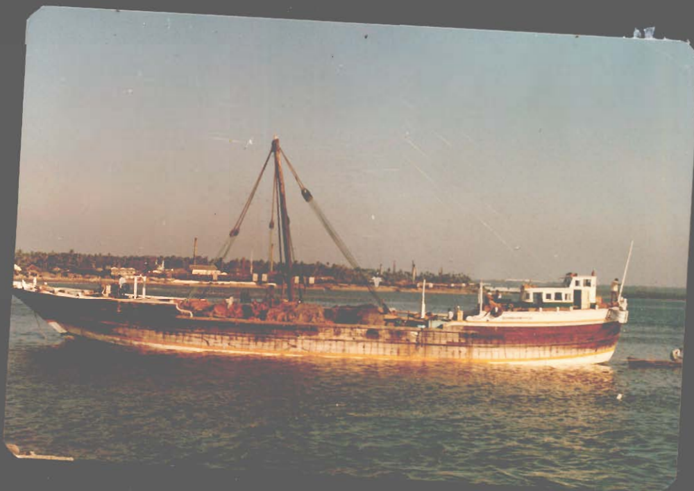
(6) A DEEP SEA FISHING VESSEL