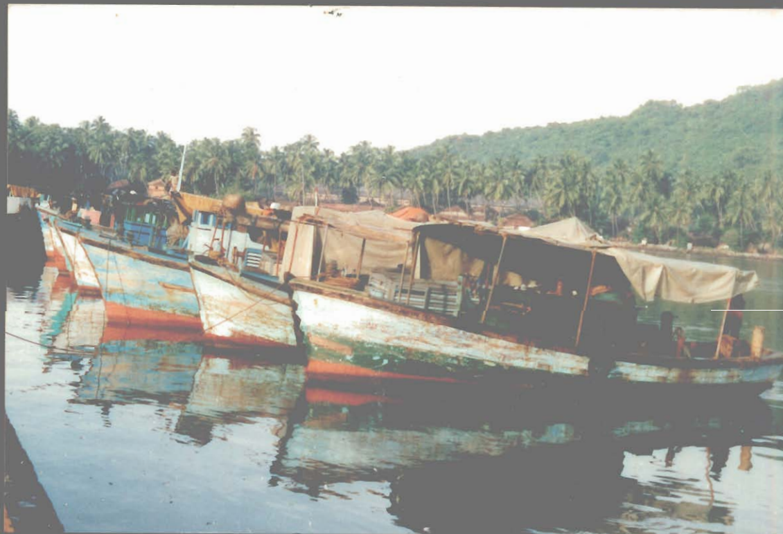
(2) IN BOARD MACHINE BOATS