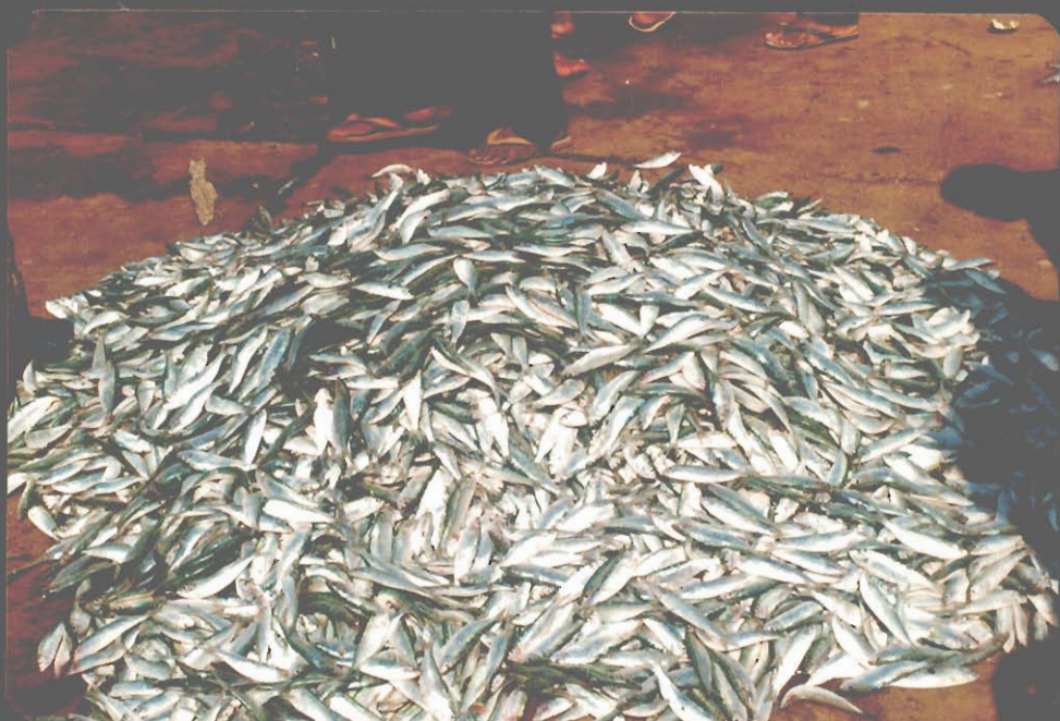
(9) WHITE SARDINE