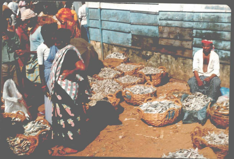
(7) A DRY FISH VENDOR