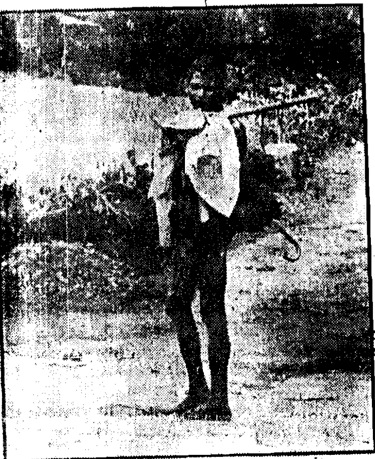
ସାବରା ଧାନ ଶେଡ଼ି ସାରିବ

Savara man going to his cultivating field with food.