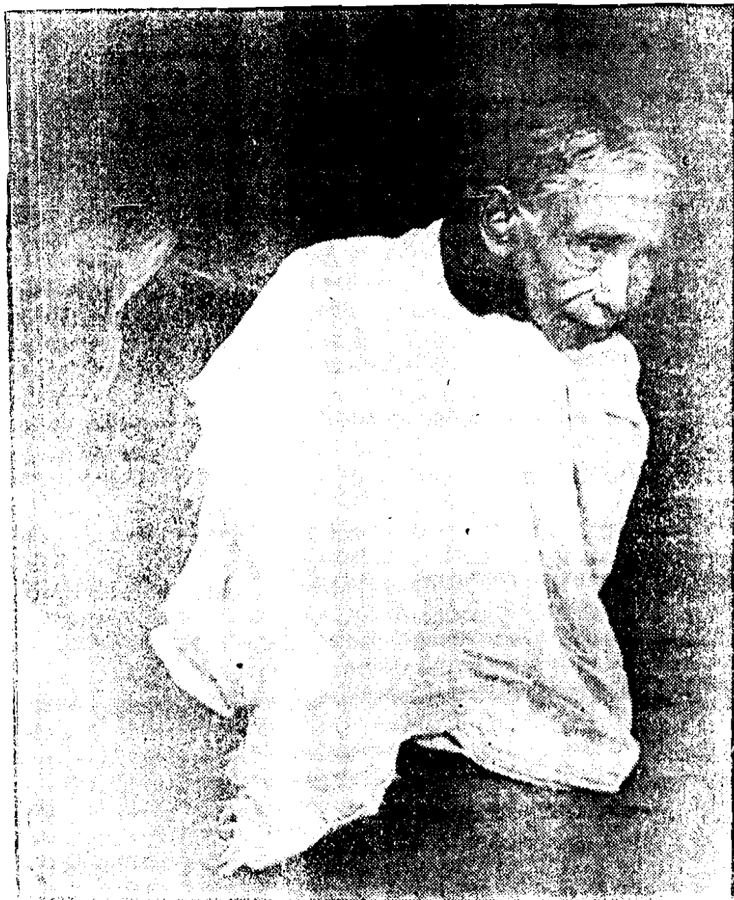
An Old Savara Woman seated in front the hut. (The Samaja, Daily News Paper (Oriya) Sunday Special.)