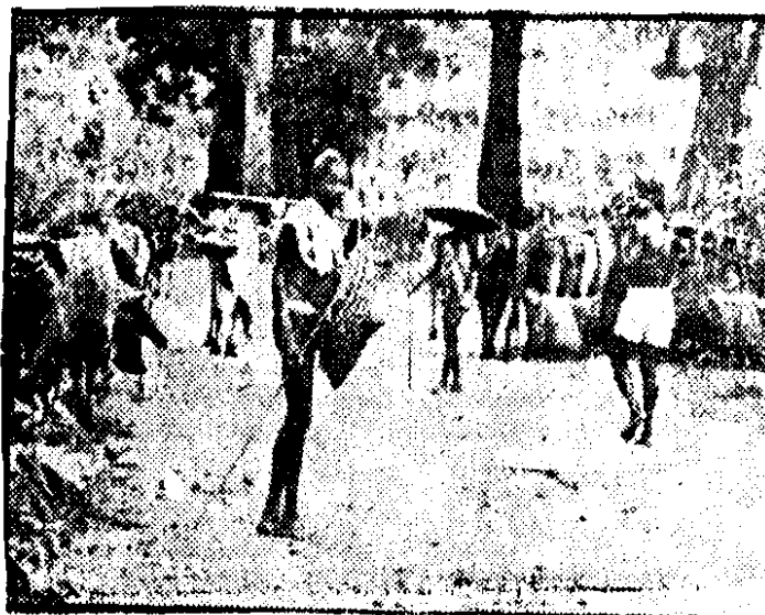
ସାବରା ଘରକୁ ଫେରୁଛନ୍ତି

The Savaras returning home from the local market.