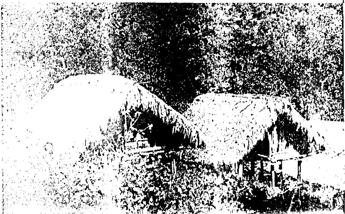
Village granaries ( The Adivasis )