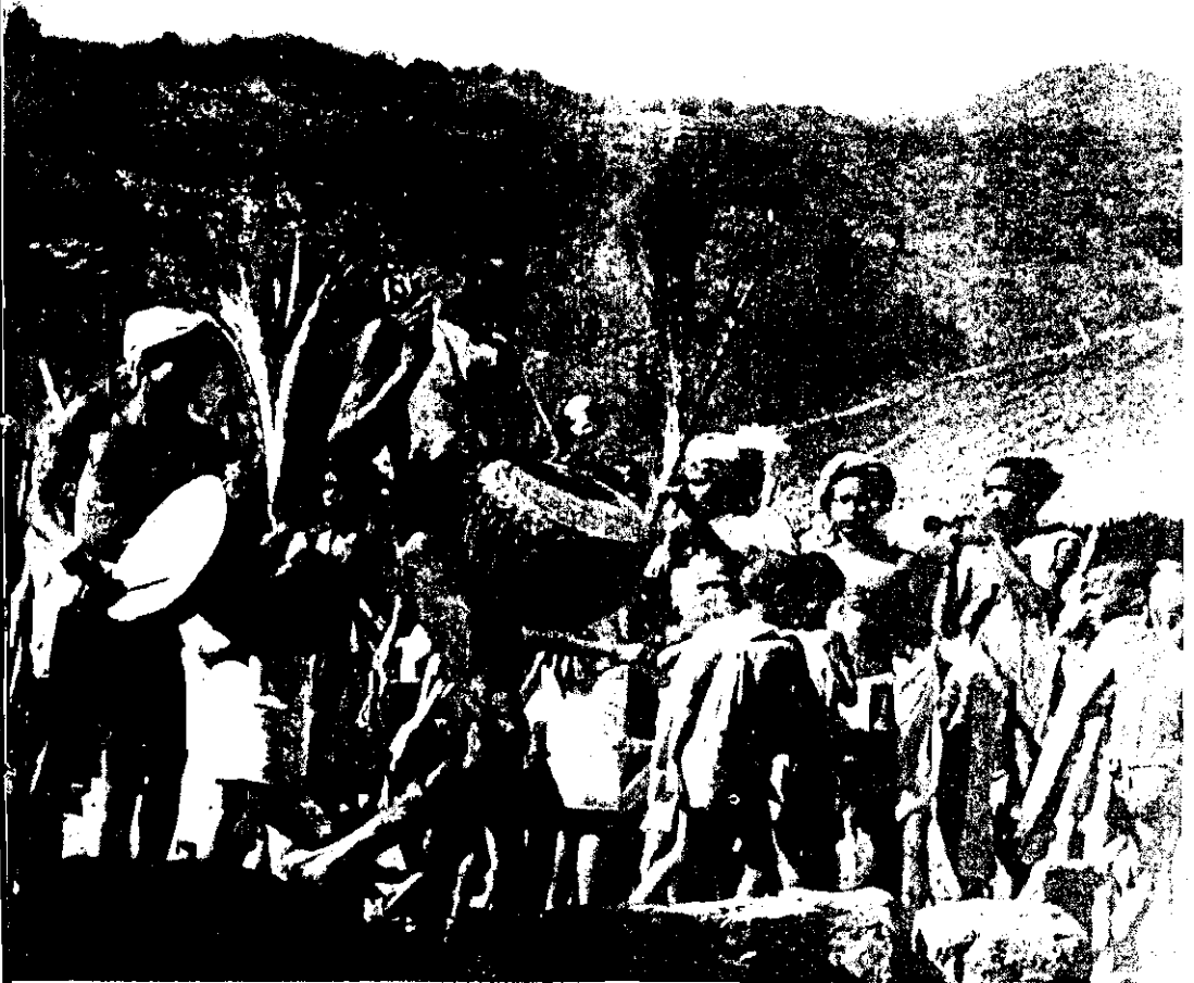
A Festive Occasion. (Some Indian Tribes)